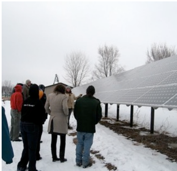
Prairiewoods, Hiawatha, IA; from IA Energy Corps

That said, many of us have an excellent wind resource available at our farms – you have probably