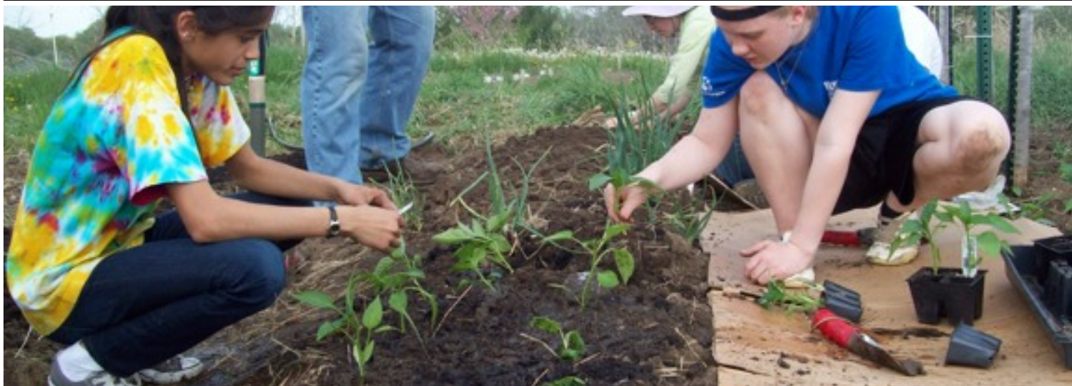
Teenagers in the AgCulture Youth Food and Farm Program, Ames