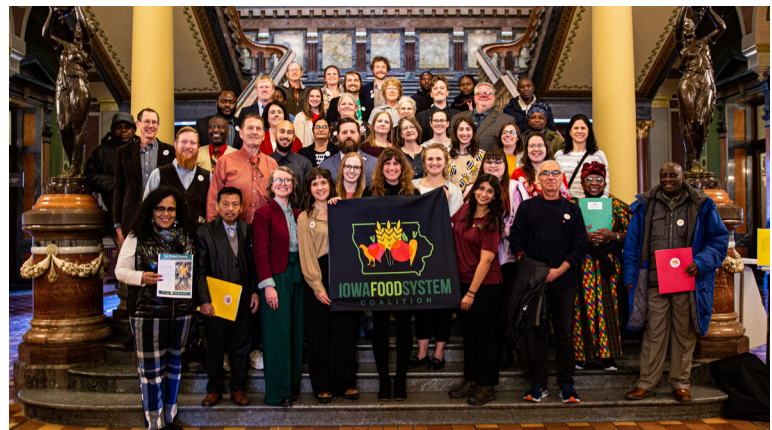
Nearly 70 Iowans attended the Jan. 23 Food and Farm Day on the Hill

Another major focus is the Choose Iowa local purchasing program and value-added grants program, which help connect Iowa-grown products with food banks and schools and provide much-needed grants for small farms to invest in equipment and infrastructure. Coalition members recognize this program as an engine for local food markets to become viable in Iowa, providing farmers around the state with the capital and the purchasing dollars to support their communities with high quality food and through local food