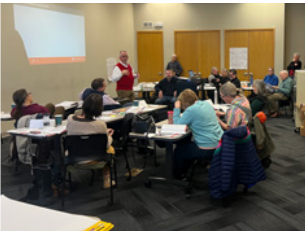
IFU Members at mental health training.

This grant could not have come at a better time, as every week, sometimes every day, it feels like something is being inflicted upon us and our communities. We brought two cohorts of about 15 people together to learn from Iowa State University Extension professionals about mental health. Our volunteers were trained in Mental Health First Aid about reducing the stigma behind this topic, understanding the language and signs that people exhibit when they are going through tough situations, and ultimately what resources are out there to share.